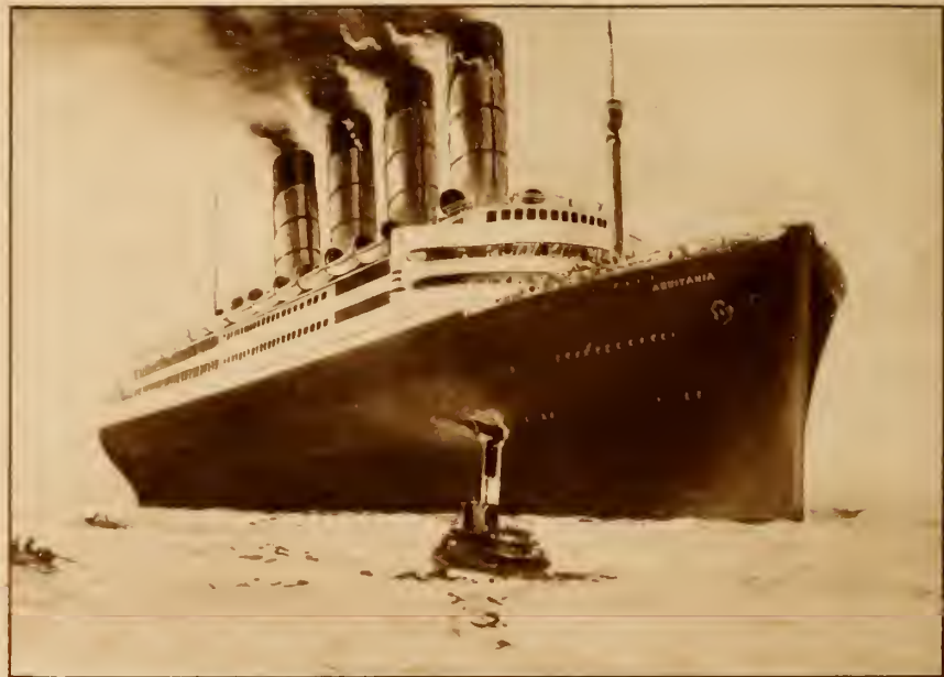
S. S. AQUITANIA. This giant ocean liner is one of the largest afloat.